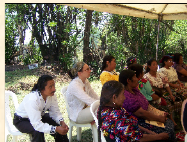
Collaborators and Traditional Midwives attending the meeting in Chinique (Medicos Descalzos)