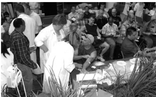
Men's Health Day