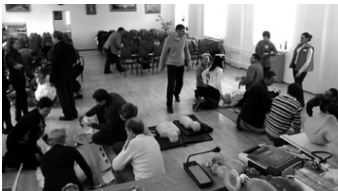
Trauma Team training in preparation for the Euro 2012 in the Ukraine

Across the border in Beer Sheva, Israel, the CGS organized a global surgery workshop for the students at the Medical School for International Health, a joint program run by Ben Gurion University and Columbia University. This workshop emphasized the academic aspects and importance of strong partnerships for effective program implementation in resource limited settings.