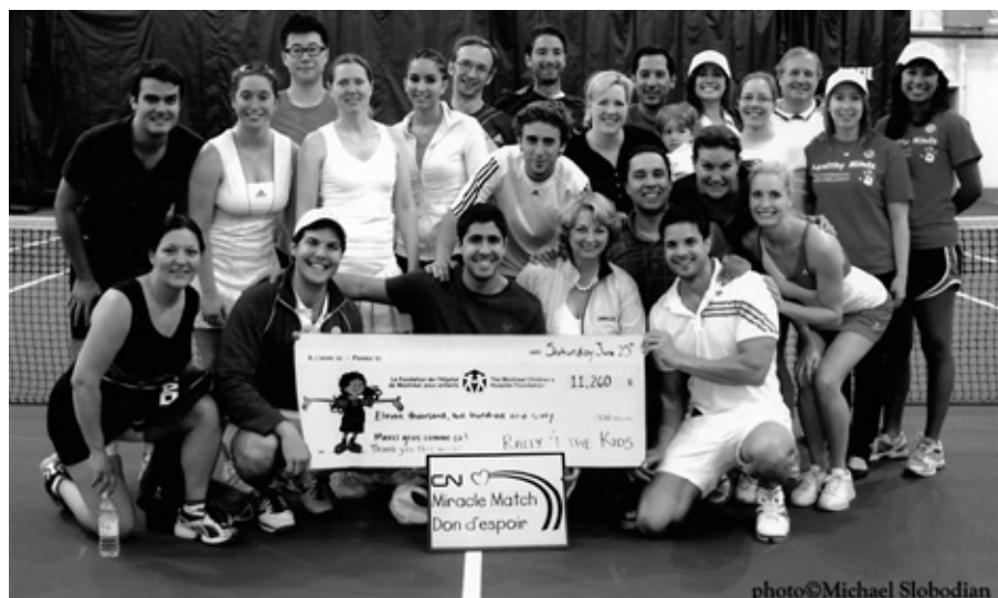
"Rally 4 Kids" Craniofacial Fundraiser - June 25th 2011