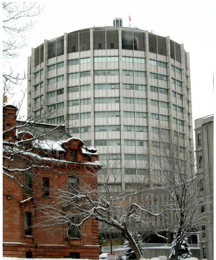
McIntyre Medical & Hosmer Building in Winter

Please note that, as this is a professional program, departmental and university funding is limited.