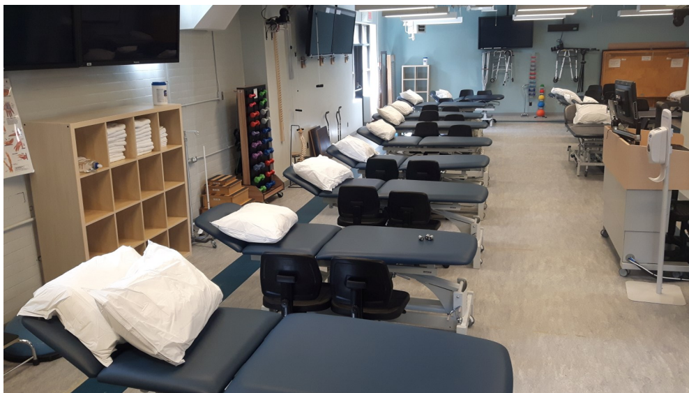
Hosmer Coach House Teaching Lab

Should you have trouble completing or submitting any application requirement due to extenuating circumstances, we encourage applicants to reach out the QY Admissions Coordinator via email ( slate.spot@mcgill.ca ) as early as possible. In exceptional documented circumstances, we may consider alternative arrangements.