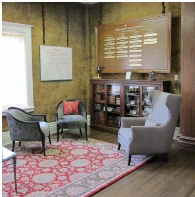
Davis House Lounge

Any questions about the application process can be directed to the QY Admission Coordinator via email .