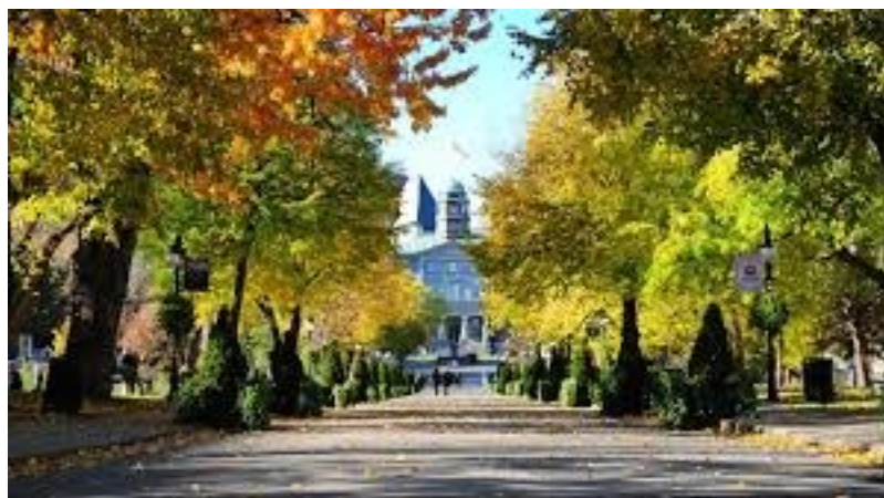
McGill Main Campus from the Roddick Gates