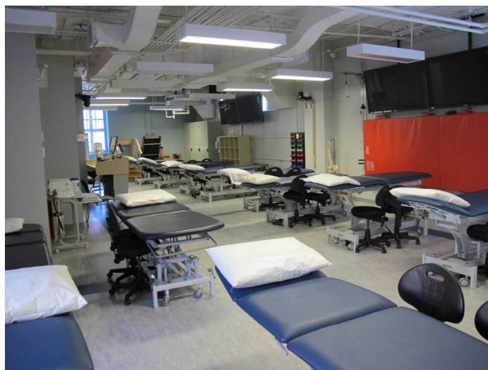
Hosmer Coach House Teaching Lab

Candidates who are not offered a place in the program will be provided with a reason in the letter of refusal. Reasons for refusal may include cGPA or CASPer score below our admission threshold, missing documentation, the applicant's ranking during the file review process, or because program capacity has been reached. Should a candidate wish for additional information on the reasons for their refusal, they should first review their application against the admission requirements. They may also make a written request for additional information, between June 20th and July 30th, by emailing the Admissions Coordinator (please include your McGill ID and program applied for: PT—QY). To protect the confidentiality of applicants, requests must be sent from the email address used to register on Slate, and cannot be made in person or via telephone. Please allow six weeks for a reply. Please note that SPOT does not have access to your CASPer test and is not able to reveal your specific CASPer score.