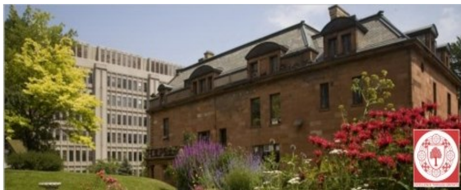
Hosmer House - Site of many SPOT teaching spaces