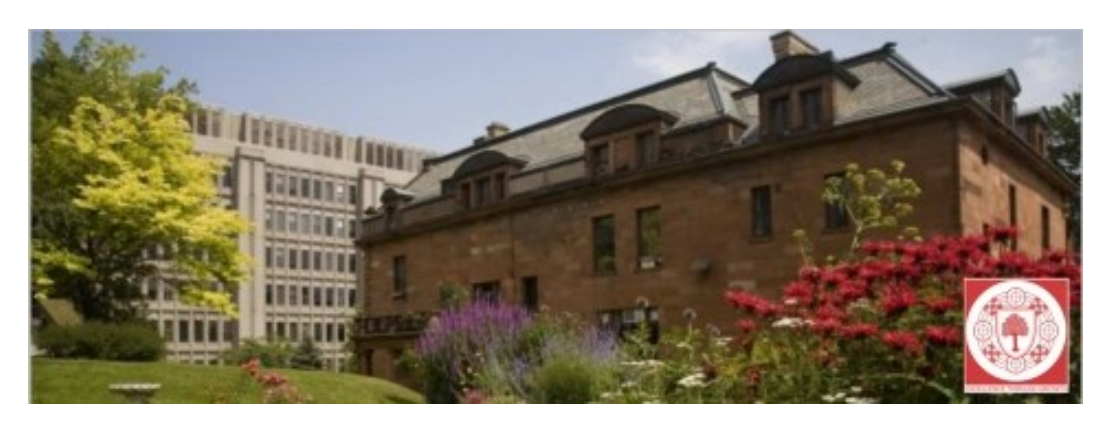
Hosmer House - Site of many SPOT teaching spaces