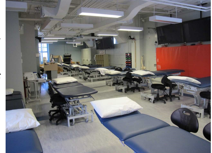
Hosmer Coach House Teaching Lab

be sent from the email used to register on uApply and cannot be made in person or via telephone. Due to the number of requests, please allow six weeks for a reply. Please note that SPOT does not have access to your <u>CASPer test</u> and is not able to reveal your specific CASPer score.