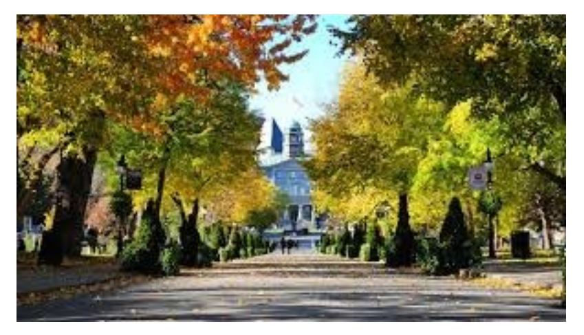
McGill Main Campus from the Roddick Gates

- Each course will be assessed following receipt of your final application. SPOT cannot determine equivalencies beforehand.