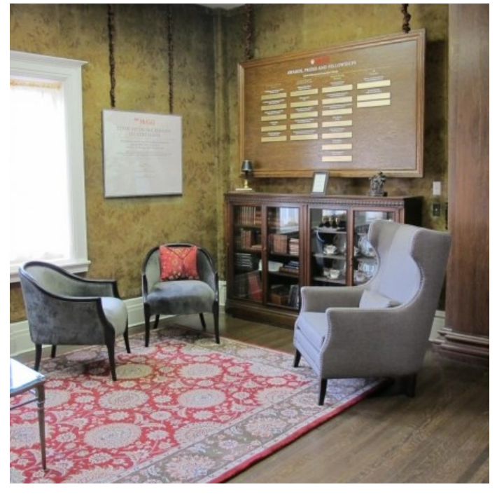
Davis House Lounge

Any questions about the process can be directed to the QY Admission Coordinator using the uApply messenger system—please do not call or email for regular questions. uApply messages are always responded to before all other inquiries.