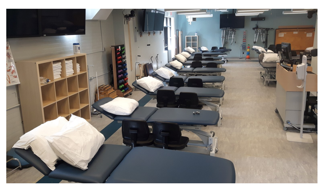
Hosmer Coach House Teaching Lab

Applicants who feel that exceptional mitigating circumstances should be taken into account during the review of their application should, after submitting (paying for) and application, communicate their request via <u>uApply messenger</u>. Should your request be in order, the Admissions Coordinator will create a document upload place on uApply for a Letter of Mitigating Circumstances. This formal letter should be addressed to the SPOT Admissions Committee and provide a detailed reason for why you believe your file should be given special considerations. We recommend including documentation for the reason of your request—such as a medical note, death certificate, or legal attestation.