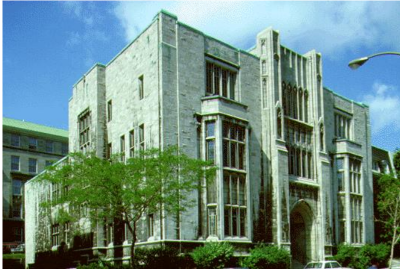
William and Henry Birks Building

The building was constructed in 1931 of many high quality materials. Stadacona limestone covers the exterior and lends the facade, with its elegant fenestration, a feeling of mass and stability. The interior contains oak panelling, plaster mouldings, wrought iron, stained glass windows, and carved wood and stone Biblical imagery such as the lamb, the true vine, the rose of the passion, the dove, and the pelican. Although there is much ornamentation throughout, it is not superfluous; it accents the function of the building which currently houses the School of Religious Studies.