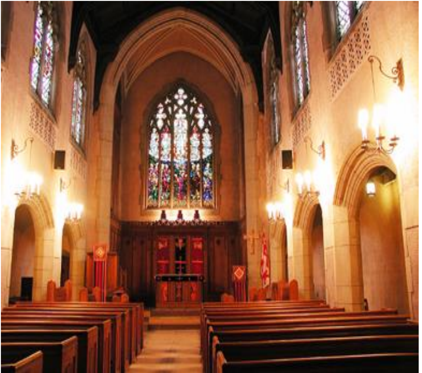
Birks Heritage Chapel – 2 nd floor, William and Henry Birks Building, McGill University