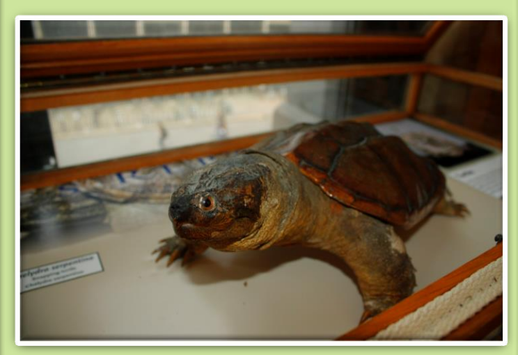
Common Snapping Turtle in the Redpath Museum