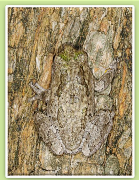
a. Gray Tree Frog<sup>32</sup>