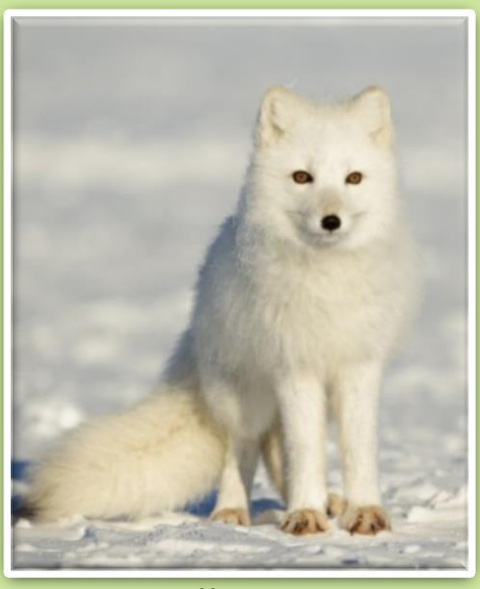
b. Arctic Fox<sup>33</sup>