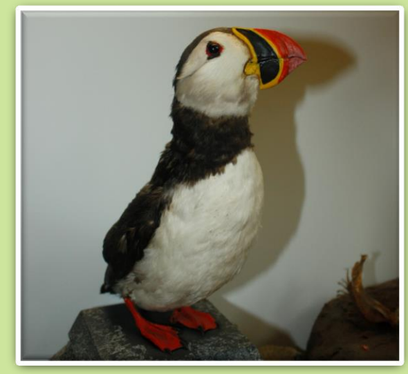
Atlantic Puffin in the Redpath Museum