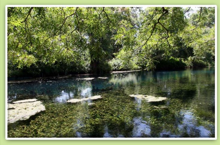
Common Snapping Turtle Habitat<sup>30</sup>