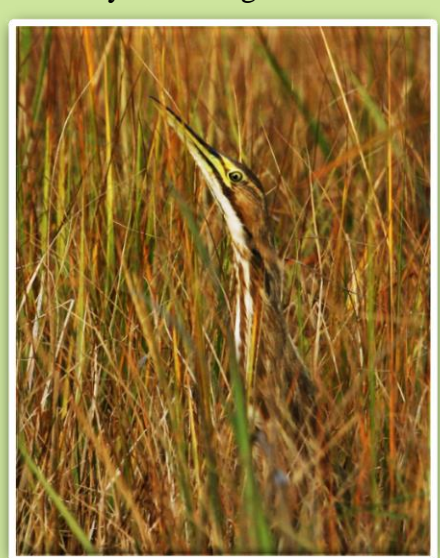
c. American Bittern<sup>34</sup>