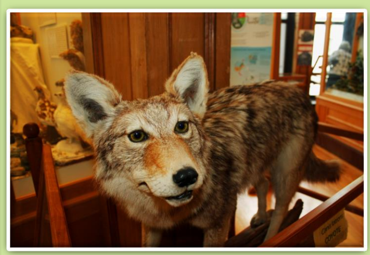
Coyote in the Redpath Museum