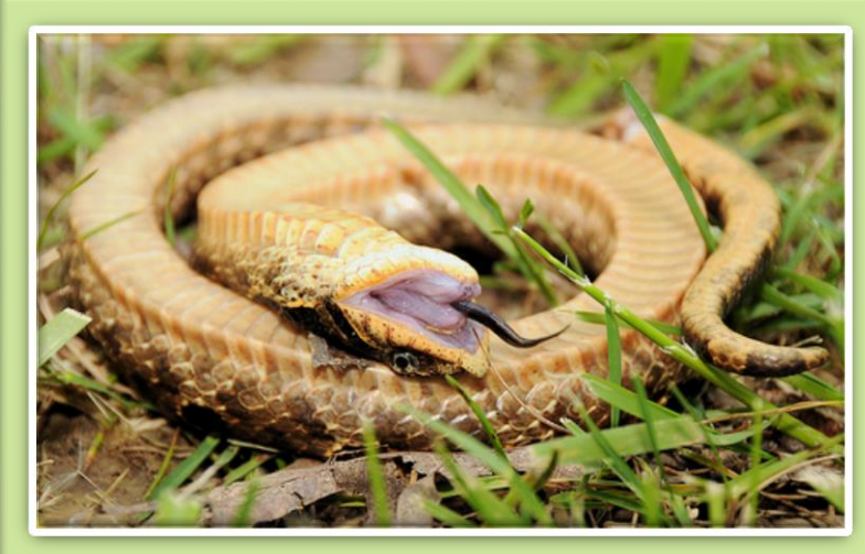
Eastern Hognose Snake "playing dead" 42