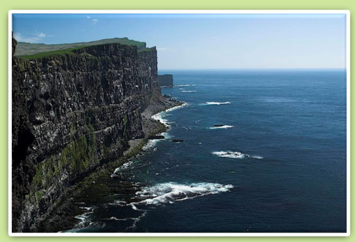
Atlantic Puffin Habitat<sup>31</sup>