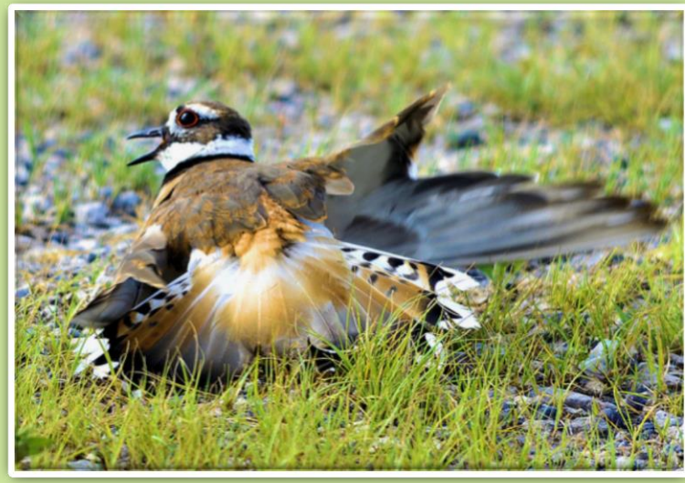
Killdeer faking injury<sup>43</sup>