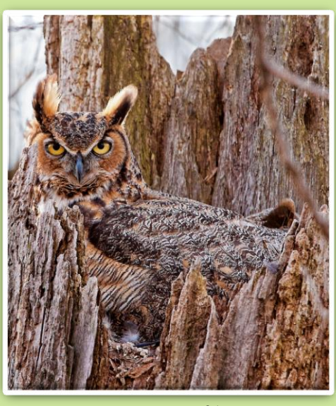
d. Great Horned Owl<sup>35</sup>