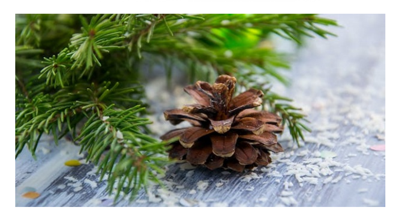
Psychiatry Weekly ~ December 11, 2023