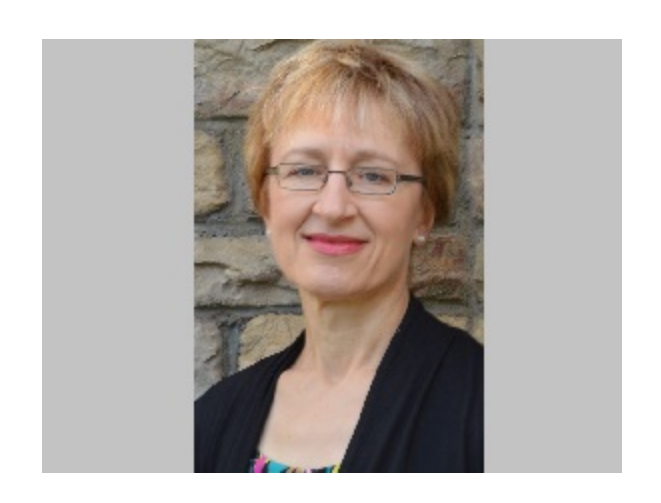
Virtual Departmental Distinguished Grand Rounds MAiD for Patients with Mental Disorders as Sole