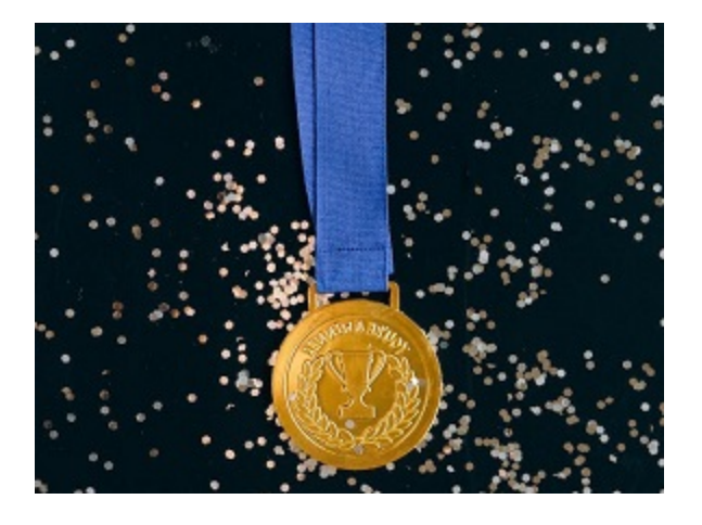
Graduate Excellence Fellowships in Mental Health Research Awards