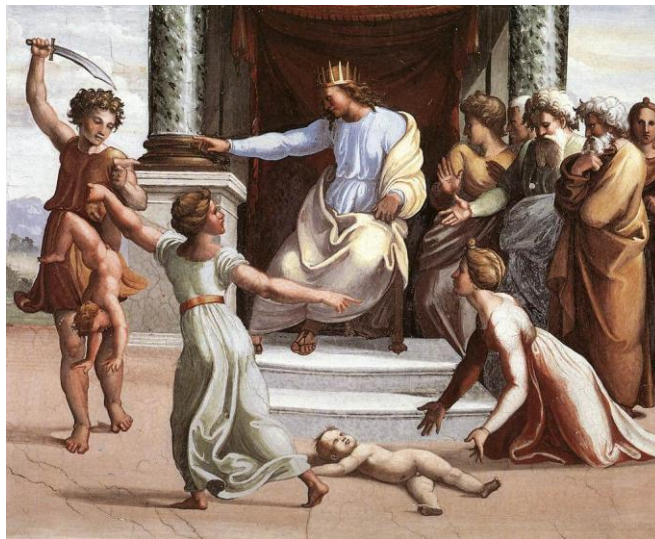
Raphaël: The Judgment of Solomon