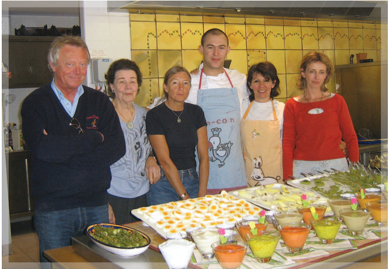
Some of the members of the kitchen team (from left to right)