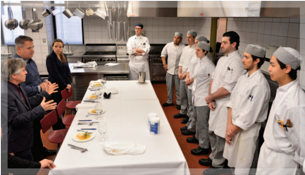
2019 Judges and Competitors