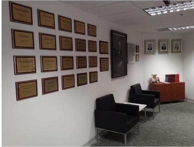
Reception area at the new headquarters of the Gerald Bronfman Department of Oncology