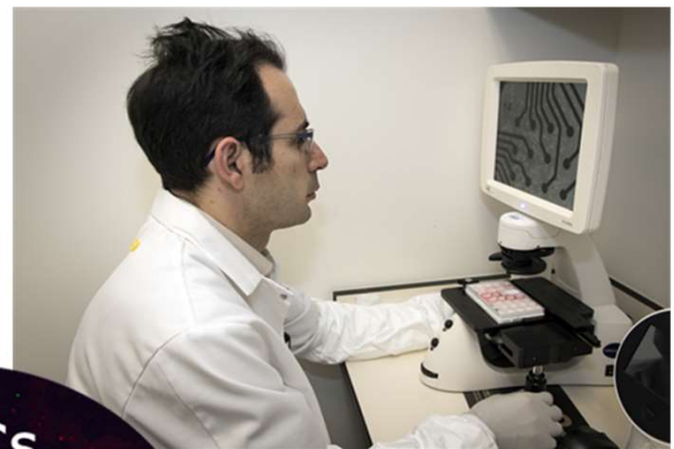
Customized assay development