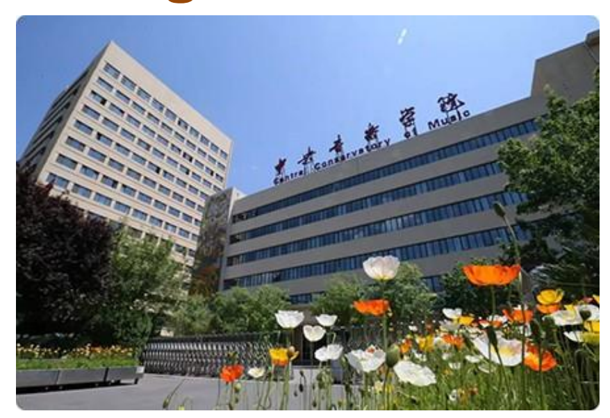
Central Conservatory of Music (Beijing, China)

Application period: January 15 – May 15, 2024