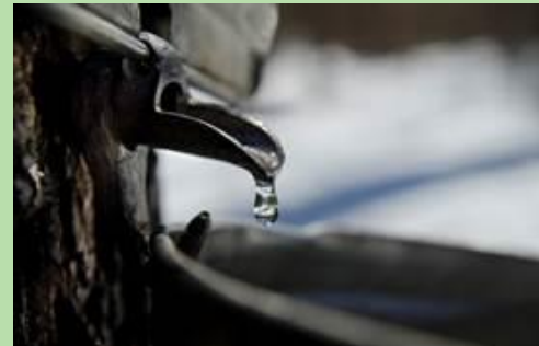
Une goutte à la fois