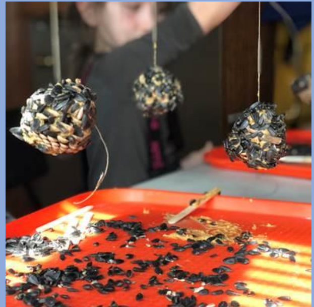
The feeders made of pinecones filled with fat and birdseed.

We look forward to the next workshop, Everyone loved this one, especially the birds!