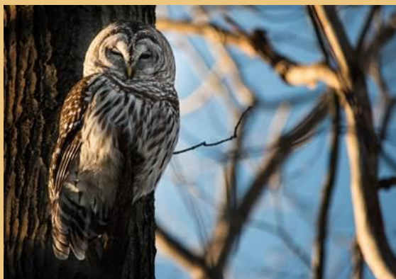
Caressing sunshine