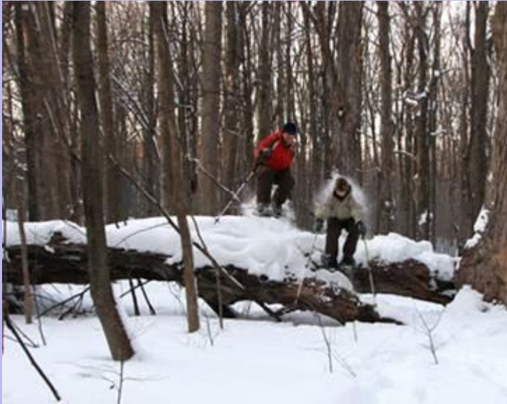
Dashing through the snow