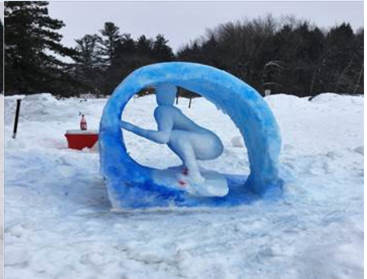
Michel Daoust surprised us once again with a unique and complex sculpture of a surfer in a wave.