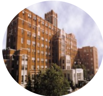
St. Mary's Family Medicine Centre