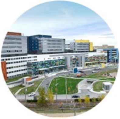
McGill University Health Centre (MUHC)