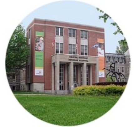
Douglas Mental Health University Institute