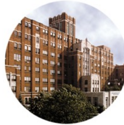
St. Mary's Hospital Center