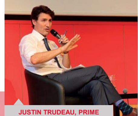
JUSTIN TRUDEAU, PRIME MINISTER OF CANADA