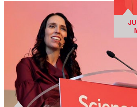
JACINDA ARDERN, PRIME MINISTER OF NEW ZEALAND