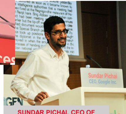
SUNDAR PICHAI, CEO OF GOOGLE