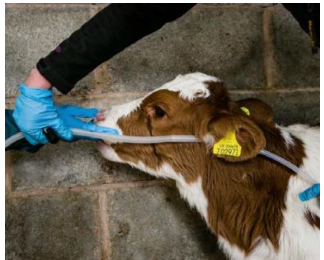
FIGURE 1: Measure the distance that the tube should be inserted