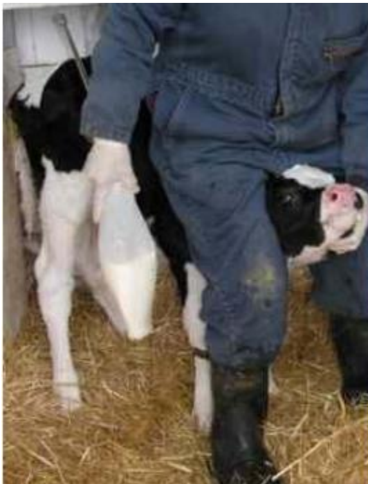
FIGURE 2: Calf restraint - standing

5.5.4.2 Ensure the head and neck remain above stomach level throughout the feeding in order to prevent aspiration of fluids.