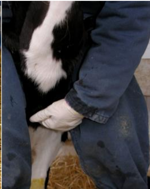
FIGURE 6: Palpate to ensure proper placement of the feeding tube