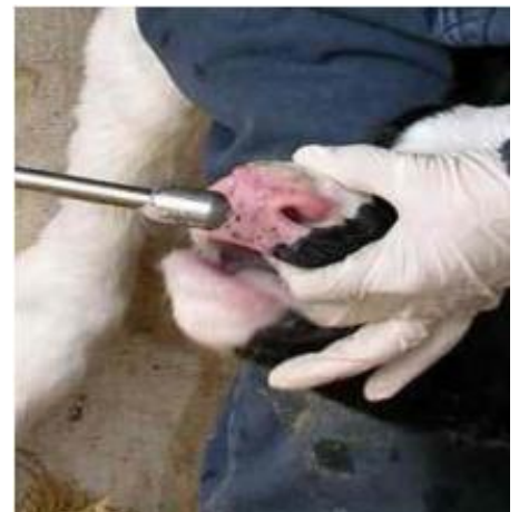
FIGURE 4: Tube insertion

5.6.4 Stop immediately if you feel any resistance, pull the tube out slightly and redirect. THE TUBE MUST NEVER BE FORCED.