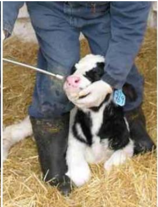
FIGURE 3: Calf restraint – sternum