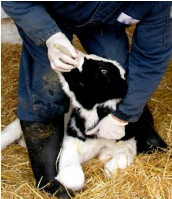
FIGURE 5: slide the tube gently down the esophagus

Do not use force when inserting the tube.