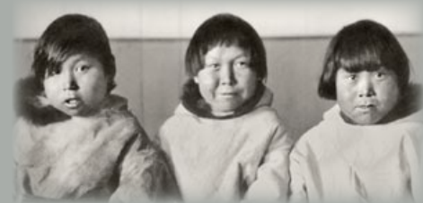
Photo of three Inuit children courtesy of Unity Archives, Herrnhut, Saxony, Germany. Moravian Archives Herrnhut, LBS 1957.