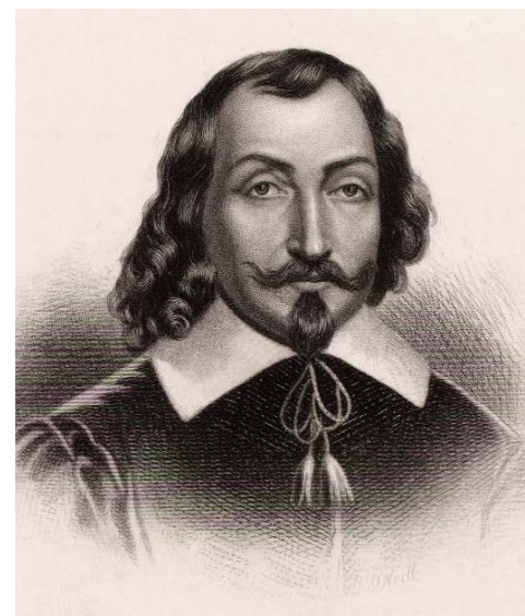
Samuel de Champlain

“And Sommers lease hath all too shorte a date”