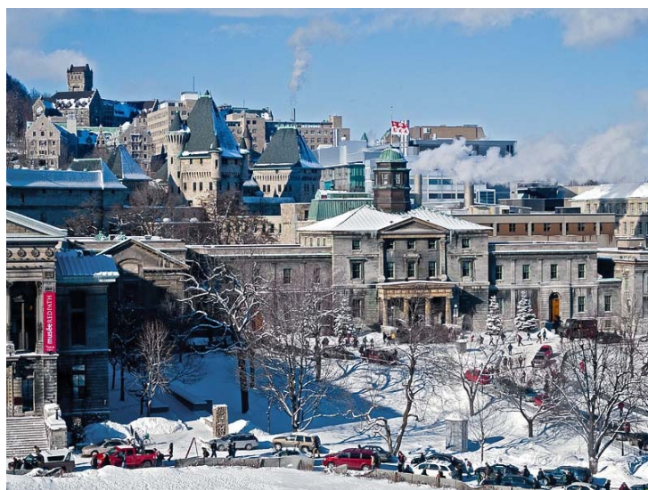
The University flag is lowered in memory of Elaine, January 23, 2008