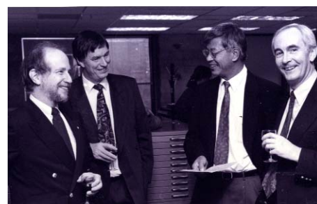
The GIC turns 10 this year. Do you recognize any faces from the reception held at its opening waaaay back in the 90s?

I teach medieval textile arts (weaving, tabletweaving, fingerloop braiding, nalbinding, sprang and luceting)