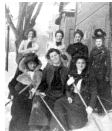
17. Hockey, January 1901