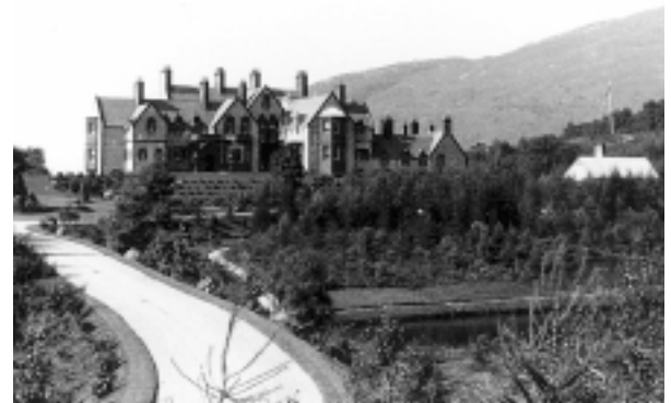
9. New House and view, Glencoe, 1905