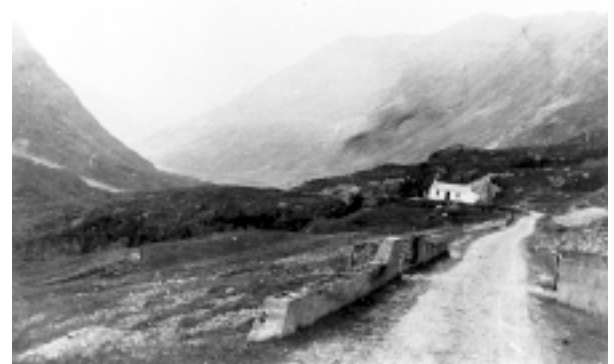
10. Pass of Glencoe from Queen's study, 1905