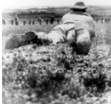
3. Militia camp at St. Joseph, 1901