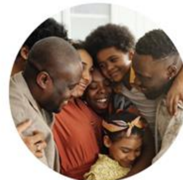
Resources for Action

https://www.mcgill.ca/equity/resources/anti-black-racism-resource