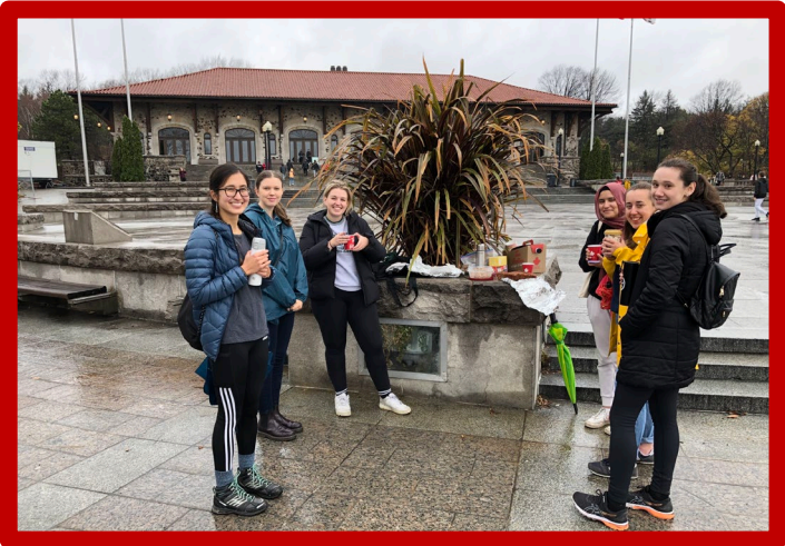
Wellness Walks and Food Tours