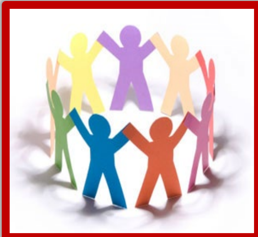
Discussion Groups and Mentoring (MAPS McGill)