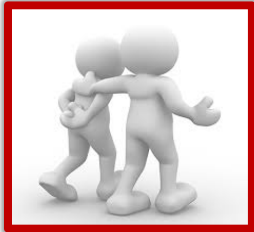
Peer Support Program: One-to-One Support