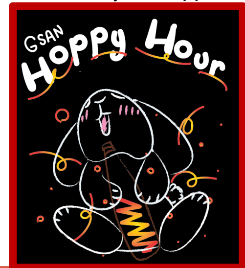
Hoppy Hour Get Togethers