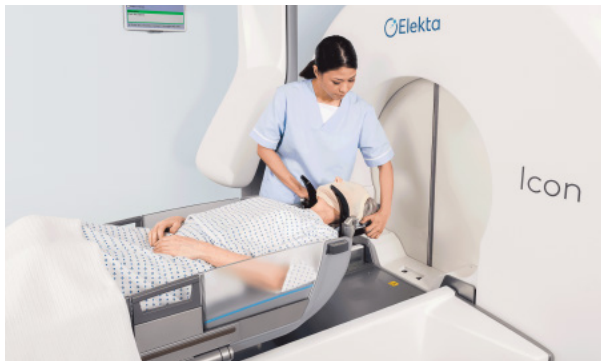
Patient undergoing SRS treatment with Gamma Knife®.

SRS is becoming the preferred treatment for patients with a limited number of brain metastases. 18 Patients with brain metastases are increasingly being treated with SRS as studies show it is associated with less cognitive decline than WBRT with no difference in survival. 18,24 However, intensity-modulated radiation therapy and memantine, two more recent developments, also have been shown to lead to less cognitive decline. 22,23