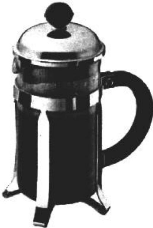
Chambord design, full

The Chambord design and the La Cafetière design are indeed similar, and although they are not identical a casual coffee drinker (or purchaser) would have trouble telling them apart. Here are pictures: