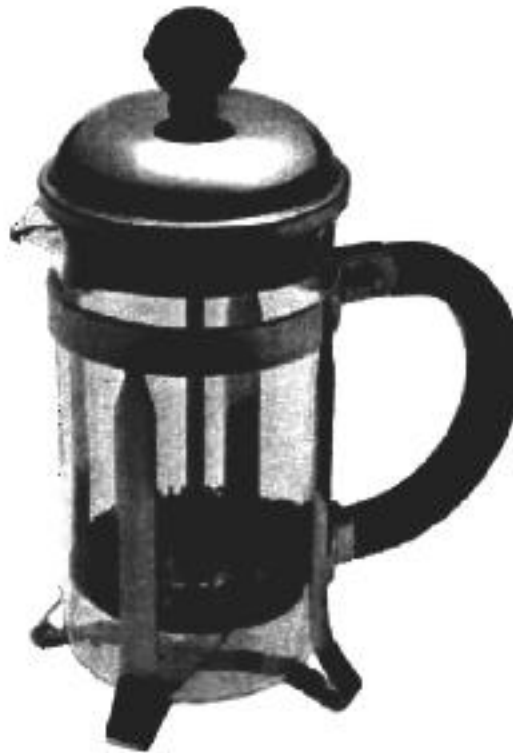
Chambord design, empty