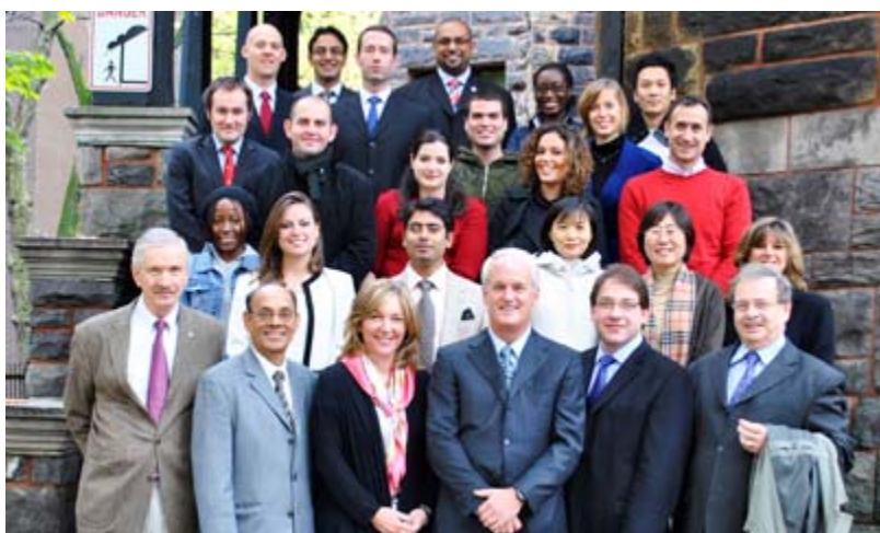
The IASL class of 2010-11 and its Faculty.

In the academic year 2009/2010, the following courses were taught: