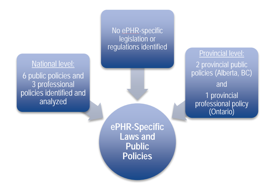
FIGURE 2 – CANADIAN ePHR-SPECIFIC LAWS AND POLICIES ANALYZED

Legal and policy sources devoted specifically to ePHRs in Canada are very limited as Figure 2 demonstrates.