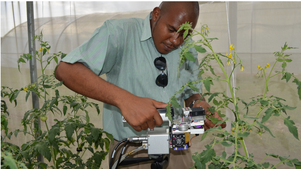
Heat tolerant tomato and sweet pepper varieties were evaluated to determine productivity levels under greenhouse conditions

project has also investigated and promoted high yielding vegetable varieties, improved post-harvest handling of fresh fruit and vegetables, and new sources of year-round forage for sheep and goats. By increasing the quantity and quality of local fruit and vegetables - and potentially animal-protein products - in school meals, the Farm to Fork model offers a way to increase nutritional diversity of school feeding programs and contribute to healthier lifestyles for children.