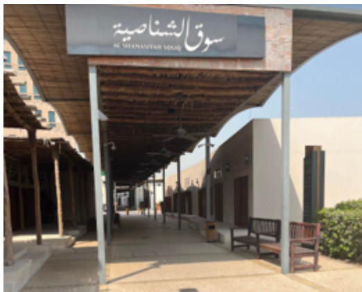
Al Shanasiyah Souq Entrance in Sharjah

Heritage preservation efforts in the gulf region have been increasingly prominent in recent decades, materializing in a variety of ways and forms. Because of the inherent malleability of heritage in the construction of heritage narratives, this project will explore the ways that heritage revitalization projects, in the form of preserved heritage districts, construct heritage narratives that reflect the development trends and goals of the city. The two cases, the Al Shindagha district within the Develop Historic Dubai Project and the Heart of Sharjah district were analyzed using satellite imagery, on site observations, and discourse analysis. It was determined that Dubai presents a heritage as progress narrative while Sharjah attempts to root its heritage in the local city, resulting in a heritage as heart narrative.