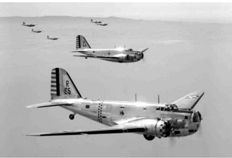
1939-1945 World War II