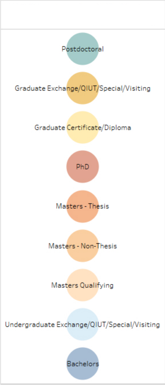
Enrolment by Degree Type