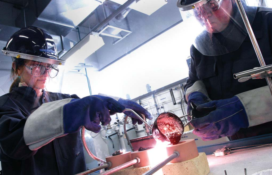
The GM Canada Research Chair is promoting new discoveries in the application of magnesium alloys in the automotive industry