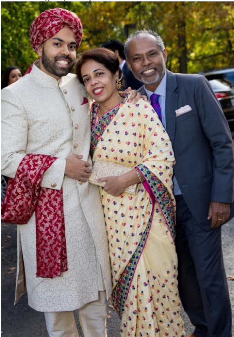
November 04, 2017 Family Picture