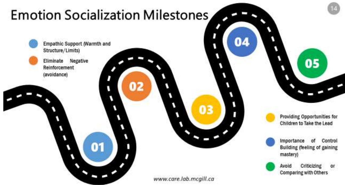
Figure 1. Parental Emotion Socialization Roadmap

Dr. Montreuil’s presentation will shed light on common misconceptions surrounding child/adolescent mental health issues. Furthermore, the presentation will cover important topics such as the importance of identifying family values and parental emotion socialization to promote children's emotional expression and improved management of anxiety-related difficulties in their children. The aim of the presentation is to provide parents with greater knowledge and strategies that will ultimately help them move away from “worry” toward “mastery” in helping their children overcome their battle with anxiety.