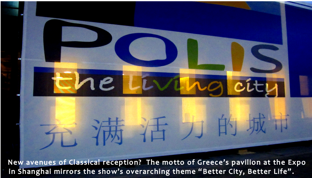
New avenues of Classical reception? The motto of Greece's pavilion at the Expo in Shanghai mirrors the show's overarching theme "Better City, Better Life".

I recently visited the Greek pavilion at the Expo in Shanghai: no marble, no classicism, no reference to antiquity. Instead, an almost naked scene: a kafenion with an olive tree and rooms of mostly black-and-white slideshows, showcasing changes in Greek city-life throughout the 20th century. That's all. It soon dawned on me that a more voluptuous display might have exceeded the budget the Greek state had assigned to its pavilion project. Or was this a deliberate decision to promote Greece as a progressive country that has so much more to offer than its ancient foundations? On my way out, I spotted the Turkish pavilion, aptly located across the street from Greece. There you have it: ancient culture in columns and capitals, celebrations of city-life in ancient Ephesus, Miletus and Constantinople, all assembled under the pavilion's forceful motto 'The Cradle of Civilization'.