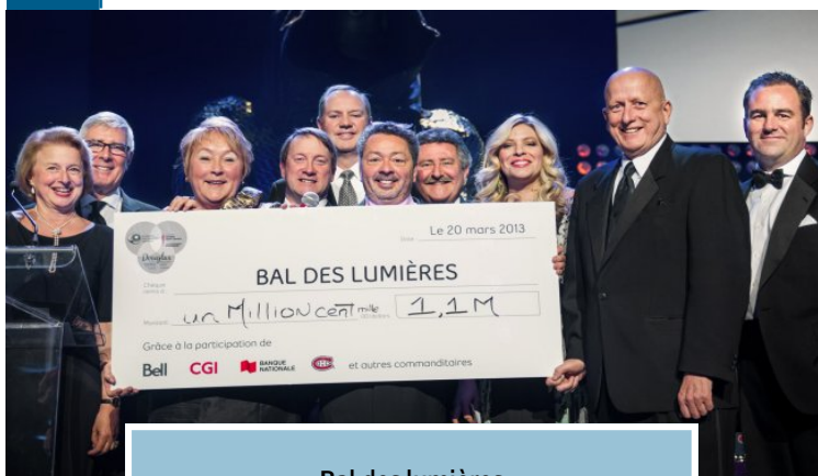
Bal des lumières