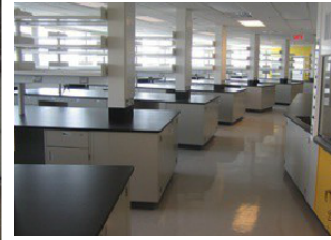
ABOVE Renovation of the laboratories before occupation.