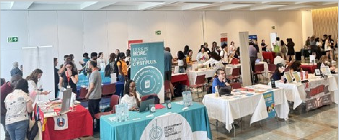
Photos taken from 2024 Graduate Orientation

The images below provide a sample of what you can expect to see: