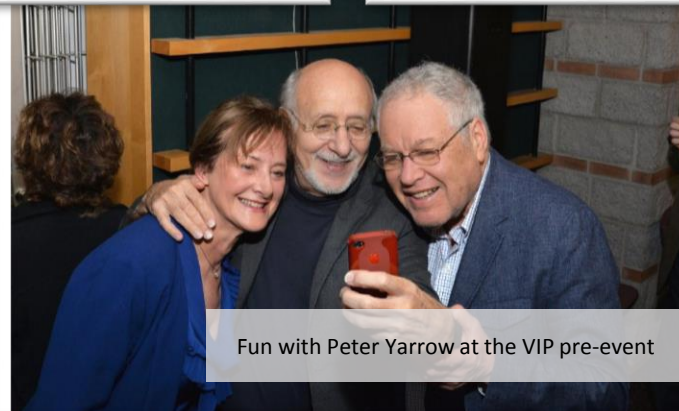
Fun with Peter Yarrow at the VIP pre-event