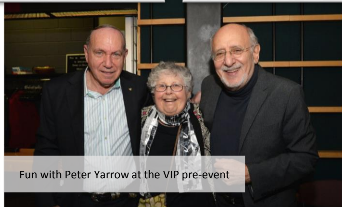
Fun with Peter Yarrow at the VIP pre-event