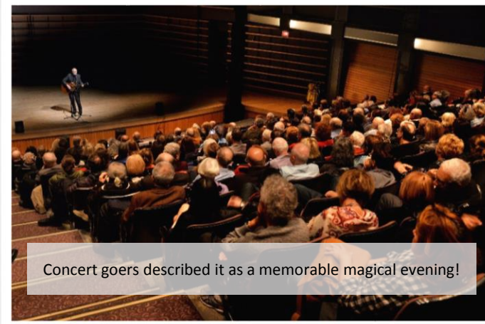
Concert goers described it as a memorable magical evening!