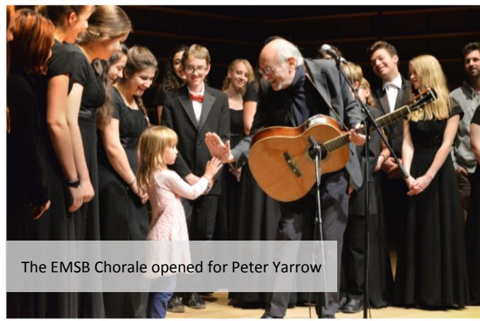
The EMSB Chorale opened for Peter Yarrow