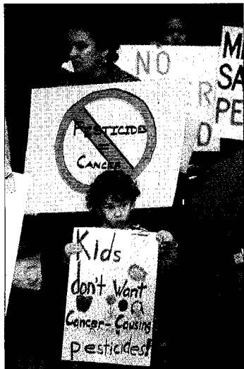
Anxiety epidemic. Protesting risks that may—or may not—be real.