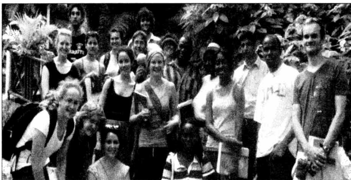
Tropical Horticulture Group visits Andromeda on Day 1 – May 26, 2009.

The first group of UWI hospitality management students will begin their programme at Disney in May of 2010.