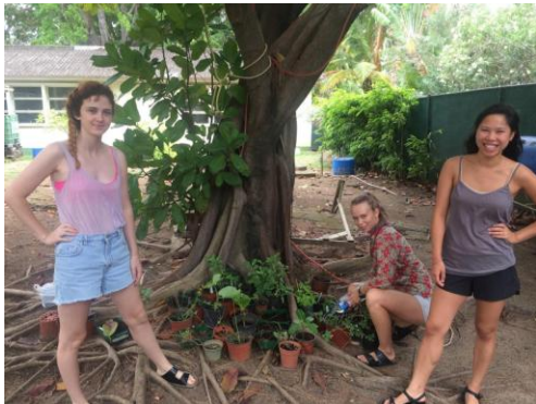
Figure 4. The Nursery at Bellairs Research Institute that we conducted

We collected around 20 native and medicinal plant species found around Barbados, which were propagated in our nursery at Bellairs situated under a tree (Figure 4). Of those we collected, 11/20 species survived to transplant to the gully: Bellyache Bush ( Jatropha gossypifolia ), Cerasee ( Momordica charantia ), Crab Eye ( Abrus precatorius ), Mimosa ( Mimosa pudica ), Monkey Hand ( Lepianthes peltata ), Poison Tree ( Sapium hippomane ), Silk Cotton ( Ceiba pentandra ), Vervain ( Stachytarpheta jamaicensis ), Wild Sage ( Lantana camara ), Yellow Crocus ( Zephyranthes citrina ), and West Indian Tea ( Capraria biflora ). The propagation method of seedling transplants was the most effective method. Although, the dryness of Barbados during June and July made it hard for survival of uprooted seedlings, such as Shame Bush ( Neptunia plena ) and Ball Bush ( Leonotis nepetifolia ), which did not survive.