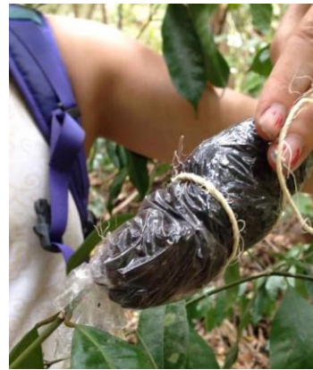
Figure 2. Wild Coffee air layering in Turner’s Hall

in rooting hormone and placed them in a rich commercial potting mix and watered daily. This propagation method was used for Bellyache Bush ( Jatropha gossypifolia ) and Black Sage ( Cordia curassavica ). Seed propagation was used for Cerasee ( Momordica charantia ) and Crab Eye ( Abrus precatorius ). The seeds were planted 2-3 times their diameter into the potting mix. Before planting the Crab Eye seeds, they were soaked in water. All other plant species were propagated by seedling transplants.