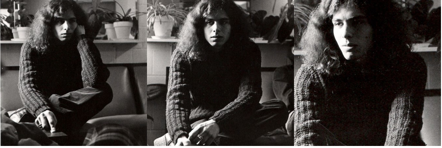
Steven Pinker in the 7 th floor lounge of the Stewart Biological Sciences Building in 1976

“My best memories of being a student at McGill are of how little I felt like a student. Commuting to a downtown campus meant that the entire downtown was my campus – the jazz clubs, coffee houses, boîtes à chansons, repertory movie theaters, and other delights of a cosmopolitan metropolis. And the Psychology Department merged the students into their scientific community – we hung out in the same lounge, had easy access to labs and offices, and socialized with them in cafes and cultural events.”