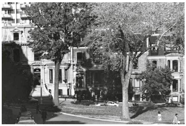
1. Jardins Prince-Arthur View from University Street

less heroic, more comprehensive, and more understanding to the complexities and contradictions of life. In its new modesty, Modernism came to accept a less than an ideal world and a willingness to conjugate modernity with the past. Concurrently, its ecological orientation translated itself into a conservative force that made the connection between contemporary design and previous architecture easier to accept. The conservation movement began with a romantic or antiquarian view of history and slowly changed to a new rational and a modern-day framework for urban development.