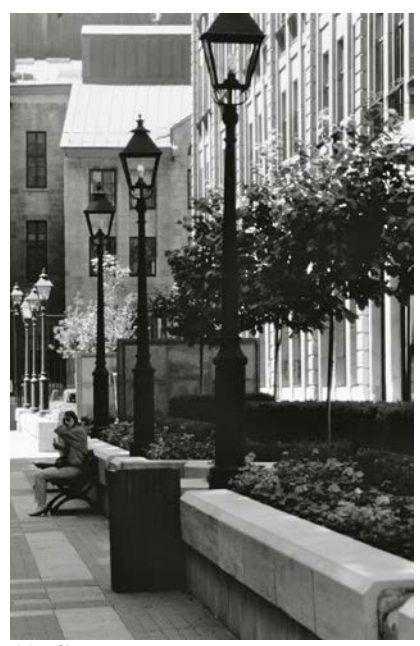
11. Cours Le Royer View of the garden

The French term cours refers to a linear tree-lined public space. Cours Le Royer, as the name implied, in an ensemble of buildings held together by such a linear public park. From the very start, it was envisaged that rue Le Royer would be transformed into a