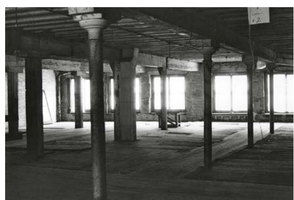
8. Cours Le Royer The raw space after the curettage

The types of dwelling units vary according to size and location within the buildings. The small units occupy a single 1,200 s.f. module while the larger ones spread over two adjacent or superimposed bays. A number of the upper floor units have atriums open to the sky. The existing floor construction, although made of timber, has a bearing capacity of 200 lbs/sf, which is about 4 times that required for residential use. This made it possible to pour a new concrete slab on top of the existing timber floor and thereby improved the acoustic performance of the floor enormously as well as increased the fire safety of the building.