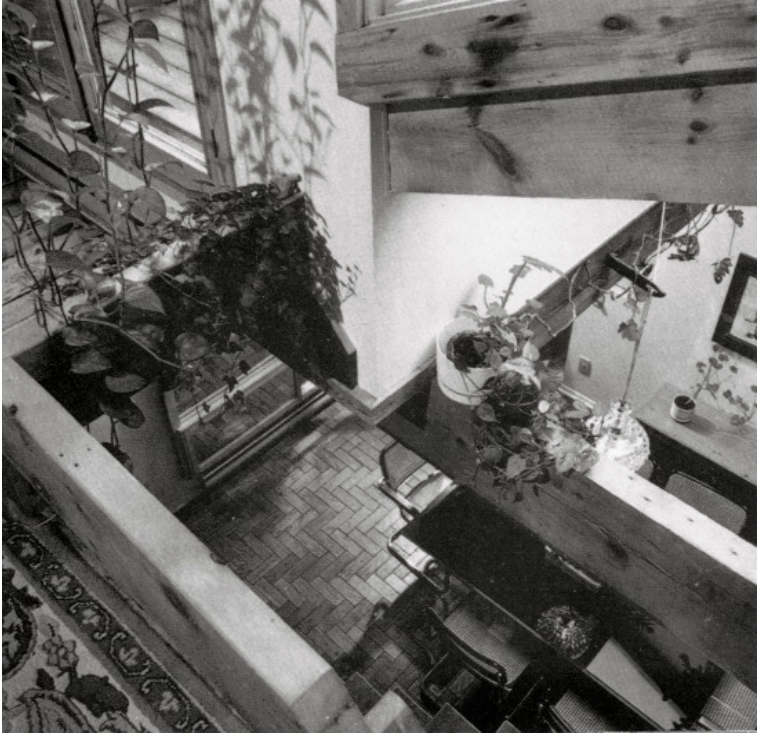
4. Jardins Prince-Arthur View of a small loft in the new module

The functional program, as formulated by the architects, called for a total of 33 dwelling units, 4,000 sf. of office space, a common garden, 12 enclosed parking stalls, 20 outdoor parking spaces, and the usual service facilities such as storage spaces, laundry rooms, and mechanical rooms. The ultimate land coverage was not to exceed 50% of the site. The brief also called for maximum variety of dwelling unit types, direct ground level access from either the street or the garden for the greatest number of dwelling units, and private outdoor extensions by means of a balcony or a garden patio for each of the dwelling units.