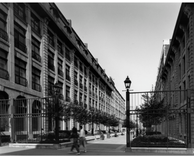
2. Cours Le Royer The public gardens

Life and social patterns are forever shifting but buildings remains fixed in time and place. A building is conceived in response to specific values and functions, but once it becomes redundant or dysfunctional, its useful life tends to end. When this happens, the building is threatened with demolition or decay. Sadly, our cities are full of these sitting ducks awaiting either extinction or annihilation. The positive alternative is to grant these buildings a new lease on life by way of converting to a new use.