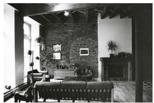
10. Cours Le Royer View of a typical dwelling unit

Cours Le Royer is an ensemble of historically significant warehouses that are situated in the very heart of the city's historic precinct. The rehabilitation project was begun in 1975 and completed 6 years later. Two of the warehouses are amongst the largest buildings in Vieux Montreal, while the third unit is a much smaller and typical building for the area. The large warehouses are rectangular in shape are positioned face to face along rue Le Royer. Their structural system is a hybrid of parallel masonry bearing