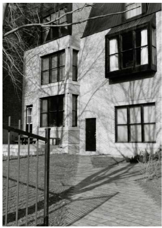
6. Jardins Prince-Arthur The modern infill module

units was very rapid, but the financial image was somewhat marred by substantial cost overruns. Ironically, the budget estimates for the new infill project were less accurate than that of the rehabilitation phase. As luck would have it, there were more unforeseen problems in construction of the new module than in the restoration of the existing houses.