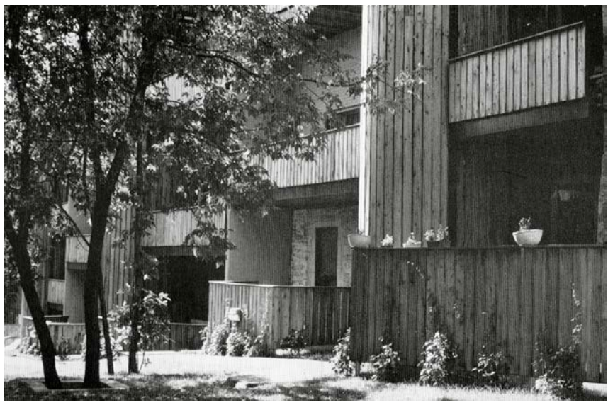
5. Jardins Prince-Arthur The common garden at the rear of the houses

New roofs and flashings were installed on the 5 houses, all windows were replaced, new fire escapes were installed at the rear of the houses, and mansards were either repaired or replaced. The interiors of the buildings were gutted and rebuilt in order to create self-contained dwelling units with all the necessary contemporary service facilities. The plumbing, electrical and heating systems were replaced. Wherever possible, interesting architectural vestiges or ornamental elements on ceilings, walls, and doors were retained. The heavy structural timber elements of the attics were left exposed. Two thirds of the dwelling units were provided with functioning wood-burning fireplaces. The original interior window shutters and the panelled wood doors and doorframes were cleaned, repaired, and re-installed. Where the ceiling height permitted it, a small mezzanine floor accessible by means of ship a ladder was constructed. Patio door were installed at the rear of the units providing easy access to