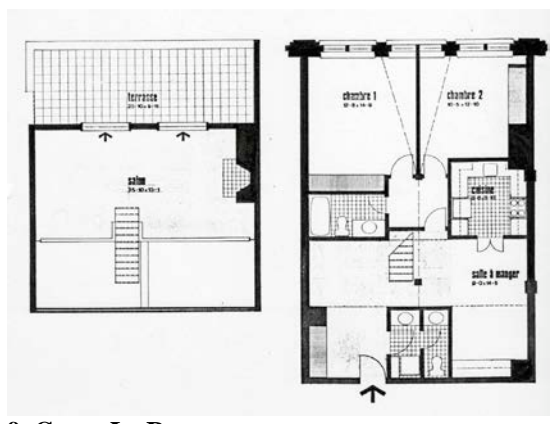
9. Cours Le Royer A typical two-level dwelling unit with a roof terrace