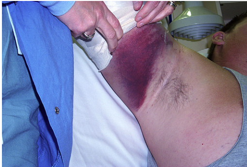
Fig. 2. A hematoma following axillary artery puncture with a 17-gauge needle during a nerve stimulation guided infraclavicular block and perineural catheter insertion. The hematoma resolved within 6 weeks, without negative sequelae.