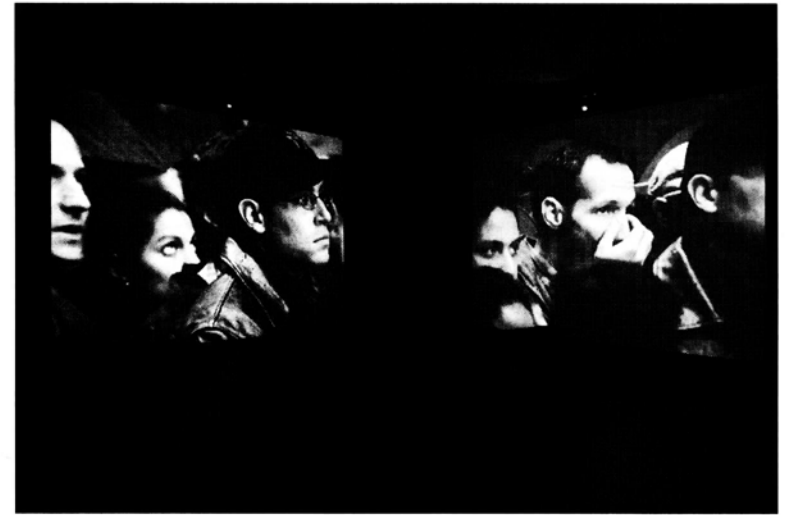
Broadway , Craigie Horsfield, © 2006. Courtesy of the artist.

It is with this statement in mind—Horsfield's description of his attempt to situate the spectator in a present that is intrinsically durational—that I want to discuss the artist's latest video installation and show how the durational, while not necessarily