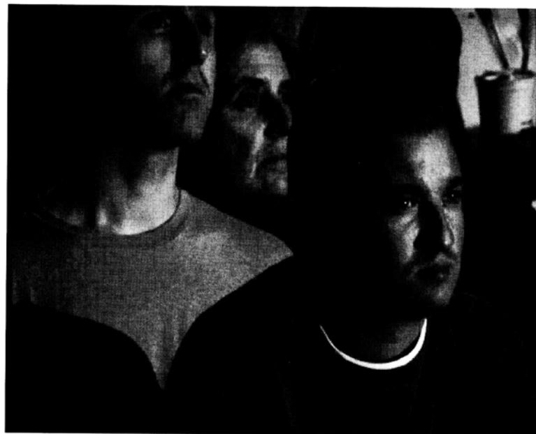
Broadway , Craigie Horsfield, © 2006. Courtesy of the artist.

disposed of as an obsolescence. They are presents themselves in that it is usually impossible to figure out which screen, in its imagery, anticipates, announces, follows or continues the other. Yet, from all these possible presents, a past present and a future present take shape.