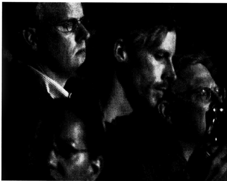
Broadway , Craigie Horsfield, © 2006. Courtesy of the artist.

In Broadway , however, attention also has another property which is not without complication for this first function of presentness. For attention, especially if we are to focus on the public of the installation, inscribes the spectator's attention in duration. This is set into play by the ways in which Broadway solicits attention from the spectators by increasingly yet inconsistently exposing them to dark images that are often difficult to read, to slowed-down images of repetitive, uneventful actions filmed in such extreme close-ups that are framed so close that representation switches into a deployment of electronic pixels, and to images in which there is nothing to see except the repeated, predictable yet more or less imperceptible act of seeing itself. These are, in many ways, empty images, images of time, time-images. As I mentioned above, Horsfield has a neuroscientific, cognitive understanding of attention. Emptying the images enables him to activate what current neuroscience and cognitive psychology see as one of the most significant effect of time-images: extended time.