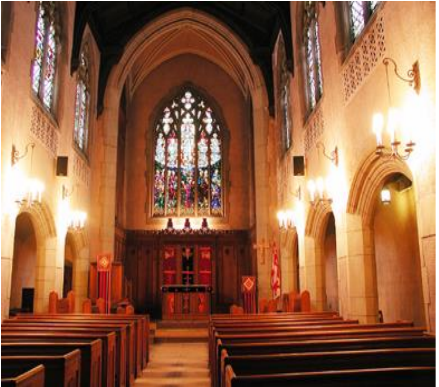
Birks Heritage Chapel – 2 nd floor, William and Henry Birks Building, McGill University