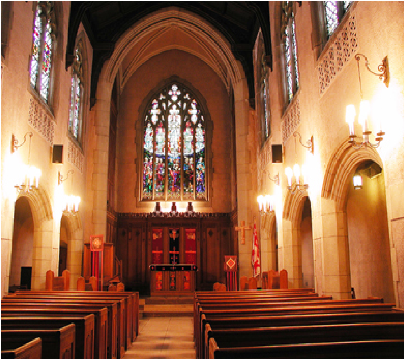
Birks Heritage Chapel – 2 nd floor, William and Henry Birks Building, McGill University