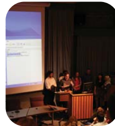
(Resident Research Day)